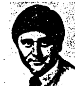
James J. Blanchard Governor